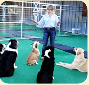
"Who's the Boss? She is!"