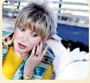
"She speaks our language!"